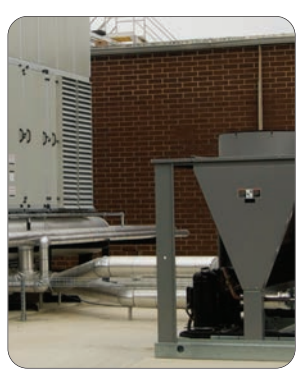
CC3-GL connection to water chiller