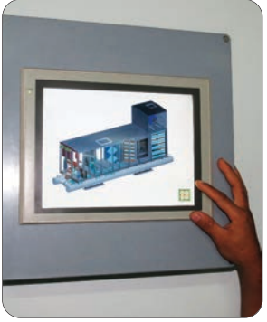
Optional remote Zeus touch screen