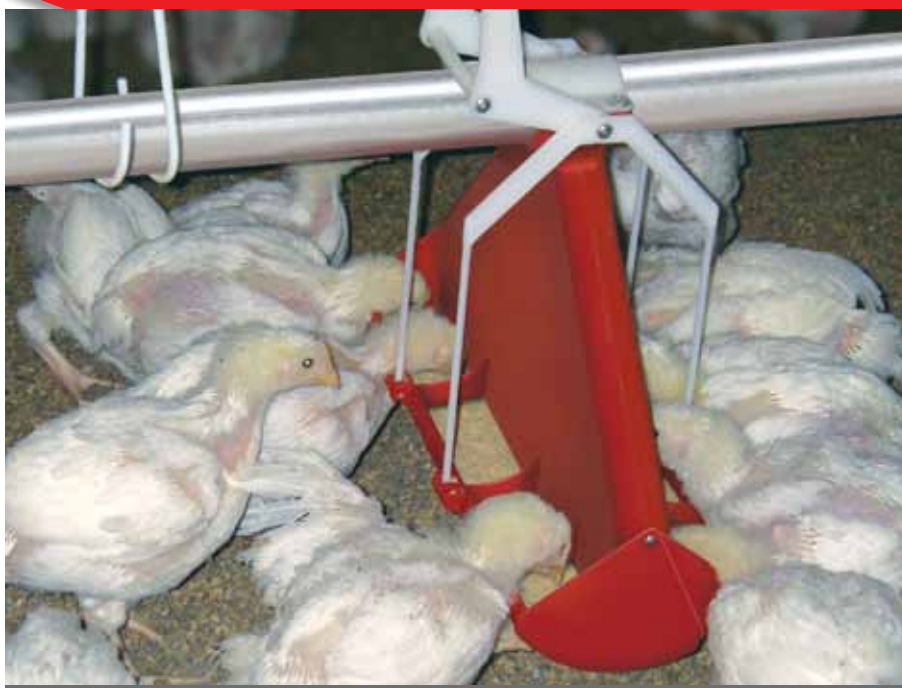
The first true perimeter feeder, the Butterfly® feeder gives birds full access to feed while keeping them out of the trays.

Created by a veteran poultry producer/inventor, the Butterfly® feeder provides numerous benefits aimed at improving your bottom line. First, the exclusive Butterfly feeder design keeps birds out of the tray for true perimeter feeding. So feed remains clean and free from unhealthy droppings. This results in healthier birds, greater weight gain, lower feed conversion rates and more profit.