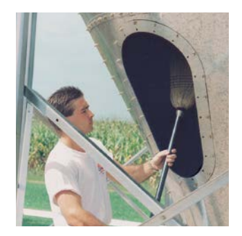
Chore-Time's ALL-OUT® Feed Storage Bins offer convenience features such as the ACCESS PLUS® Hopper Access Door.