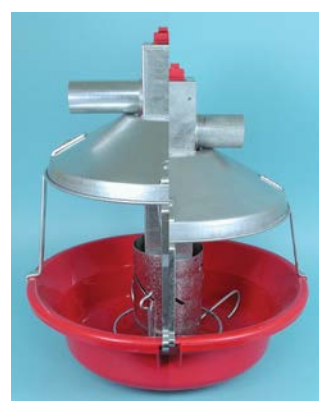
Chore-Time's Adult Turkey Feeder comes in two models. The MODEL ATF™ PLUS (left) has two more inches of eating space between the pan and shield and also under the feed tube than the MODEL ATF™ Feeder has in order to give big birds more room.