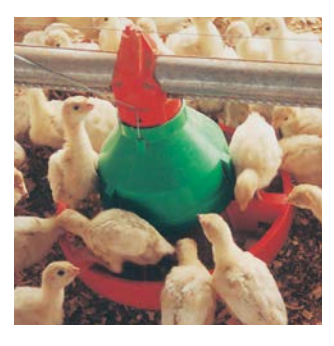
CHORE-TIME'S MODEL H2™ PLUS Poult Feeder features simple flood feeding and a completely grill-less design.