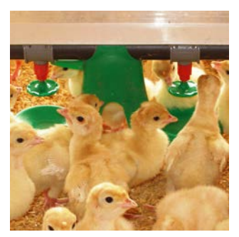
With Chore-Time's patented ADVANTI-FLOW® Poult Drinker, birds drink from uniquely designed nipple drinker discs and also from litter-saving dual catch cups. Poults get plenty of water, and floors stay drier.