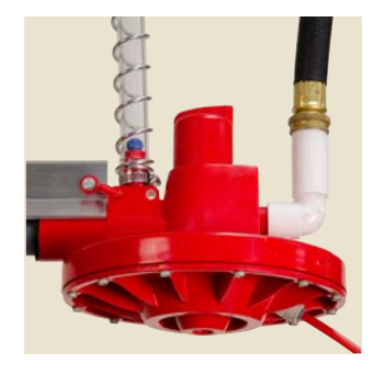
Chore-Time's Regulator and Stand Tube provide plenty of water. PDS and standard regulator models available. Single, large selector knob with on, off and flush positions.