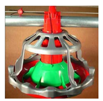
The LIBERTY® Feeder's Feed Cone can be winched for a variable flood level as birds grow or manually locked in place.