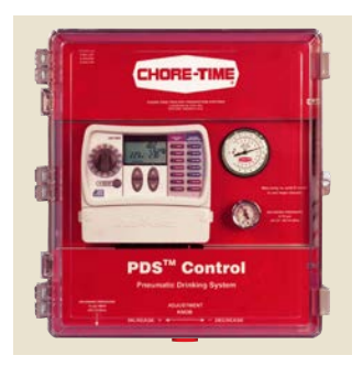
Chore-Time's PDS™ Controls permit producers to change the water pressure in all drinker lines or to flush all lines in the house from one remote location.